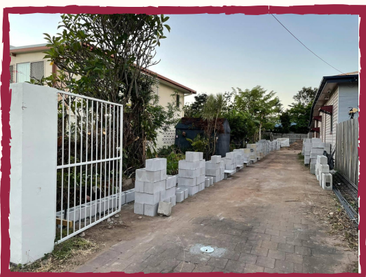
Construction of the block wall around 185 Ross River Road.