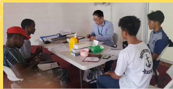
Brothers and sisters attended the first COVID vaccination pop-up clinic at the Mosque on the 29th of October. Staff from Queensland Health consulted with the attendees before giving them their vaccine.