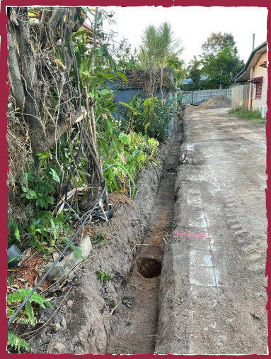
Digging a path to lay the foundation for the block wall.