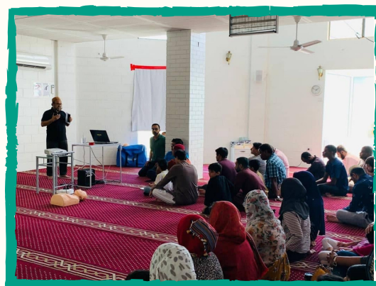
Brothers and sisters attended the AIMA Lifesaving Skills workshop at the mosque on the 25th of September.